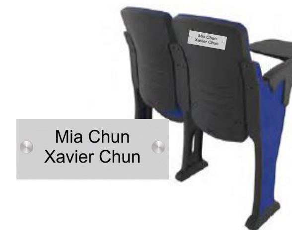
Mia Chun Xavier Chun

Each of our 240 Theatre seats is available for students, parents and families to sponsor. For a donation of $500, your name or names will be placed on a plaque on the rear of a seat, support.